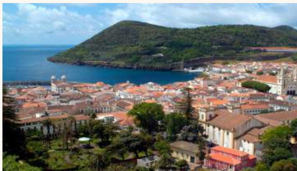
ANGRA DO HEROISMO, PORTUGAL