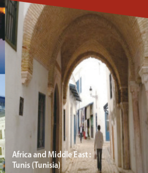
Africa and Middle East : Tunis (Tunisia)