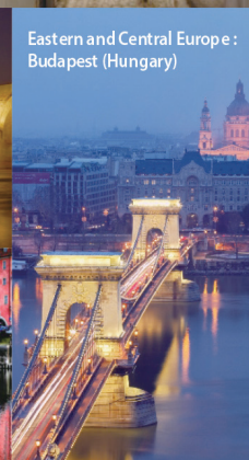
Eastern and Central Europe : Budapest (Hungary)