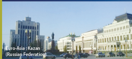
Euro-Asia : Kazan (Russian Federation)