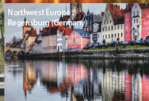
Northwest Europe : Regensburg (Germany)