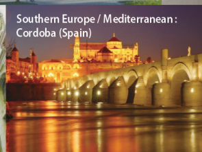
Southern Europe / Mediterranean : Cordoba (Spain)