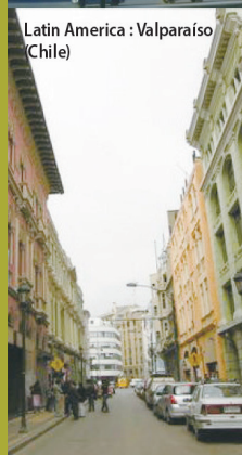
Latin America : Valparaíso (Chile)