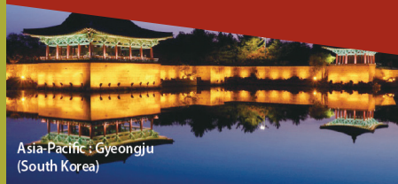
Asia-Pacific : Gyeongju (South Korea)